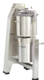
R 30 - R 30 V.V.