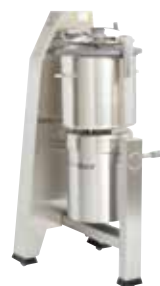
R 45 - R 45 V.V.